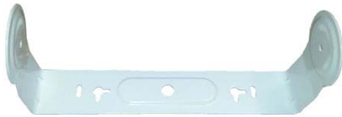
The speakers comes with a U Brackett

The plastic handle screw knob makes it a snap for installation.