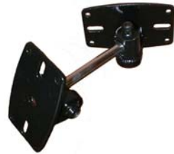
SB 35B Optional Universal Mount Bracket

The plastic handle screw knob makes it a snap for installation.