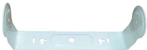
The speakers comes with a U Brackett

The plastic handle screw knob makes it a snap for installation.