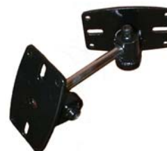
SB 35B Optional Universal Mount Bracket

The plastic handle screw knob makes it a snap for installation.