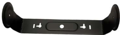
The speakers comes with a U Brackett

The plastic handle screw knob makes it a snap for installation.